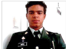
Drowning of Paterson teen confirmed