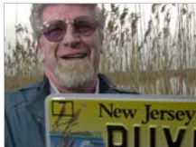
Meadowlands license plate artist dies