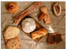
North Jersey's world of bread