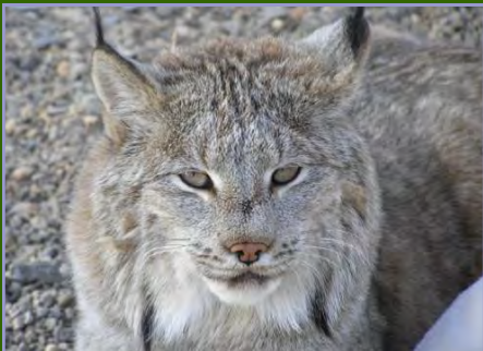
Our Educational Ambassador—Lady Jane

Woodlands Wildlife Refuge is a 501c3 charity serving New Jersey's wild and human communities since 1986. We receive no local, state or federal funding and rely completely on donations.