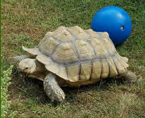
Our Educational Ambassador—Roomba