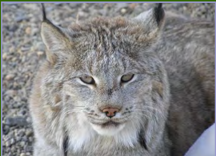
Our Educational Ambassador—Lady Jane

Woodlands Wildlife Refuge is a 501c3 charity serving New Jersey's wild and human communities since 1986. We receive no local, state or federal funding and rely completely on donations.