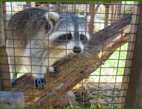
Our Educational Ambassador—Buddy